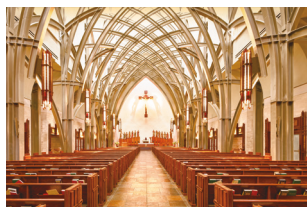
Houses of worship