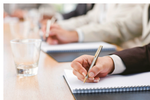
Law courts and conference halls