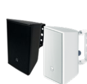
F-03BT-WP-UE / F-03WT-WP-UE