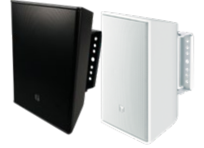
F-08BT-WP-UE / F-08WT-WP-UE