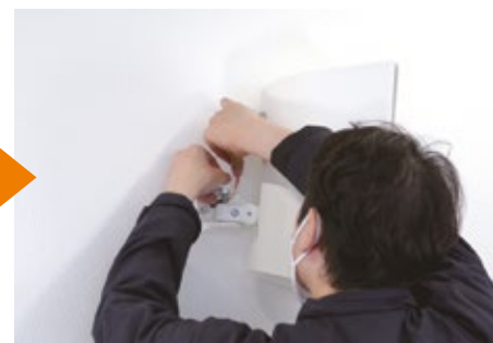
Wiring with Both Hands