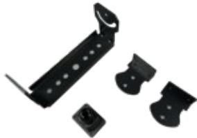
Accessory: Speaker mounting bracket for EN54 and WP versions (included)