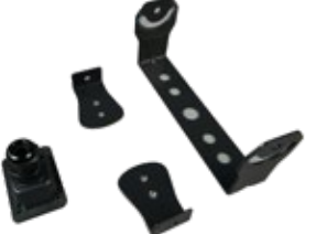
Accessory: Speaker mounting bracket for EN54 and WP versions (included)