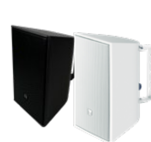
F-05BT-WP-UE / F-05WT-WP-UE