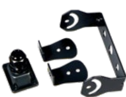
Accessory: Speaker mounting bracket for EN54 and WP versions (included)