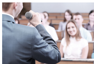
Law courts and conference halls